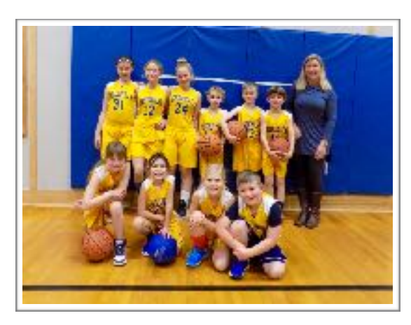
Brooklin School B-Team